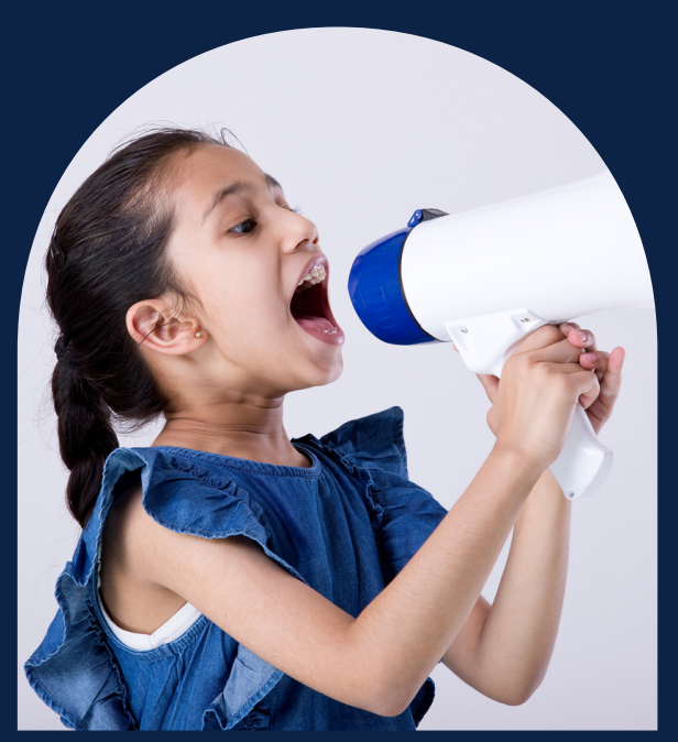
HOW WILL DIVERSE VOICES BE PRIORITISED?

HOW WILL WE BRING INFORMATION TOGETHER FROM DISPARATE SOURCES?